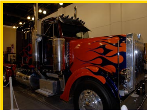
Photo Studio -puts you in the middle of the Transformers Action! Get your picture on the green screen and you'll look and feel like you are part of the movie!

Autographs -will be available from many of your long time favorite Transformers ' voice actors and other special guests.