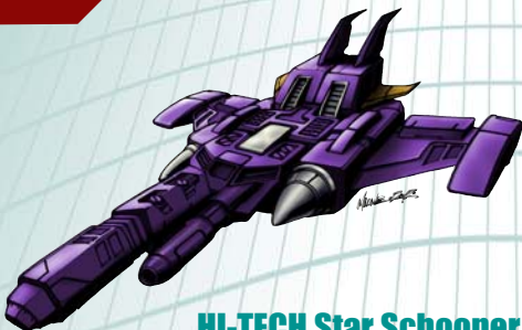
HI-TECH Star Schooner